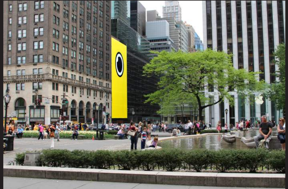
VIEW FROM THE PLAZA