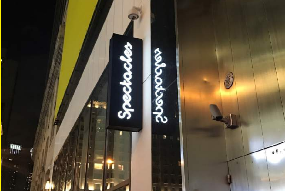
ILLUMINATED BLADE SIGN