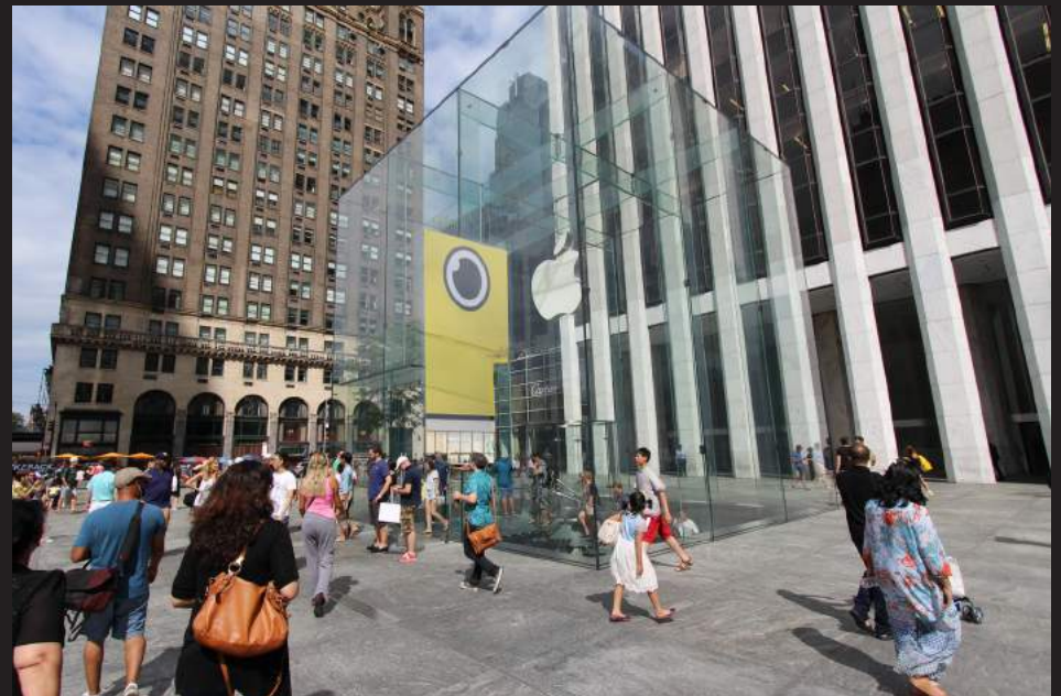
VIEW THROUGH APPLE