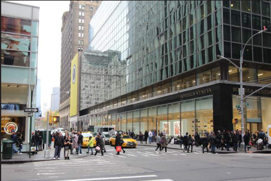
VIEW FROM MADISON AVENUE