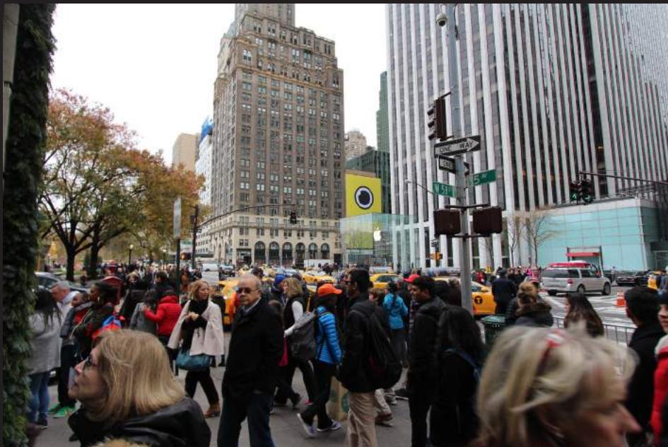
VIEW FROM BERGDORF GOODMAN